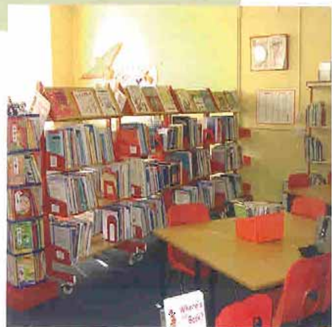
Yeo Valley Primary – non-fiction area