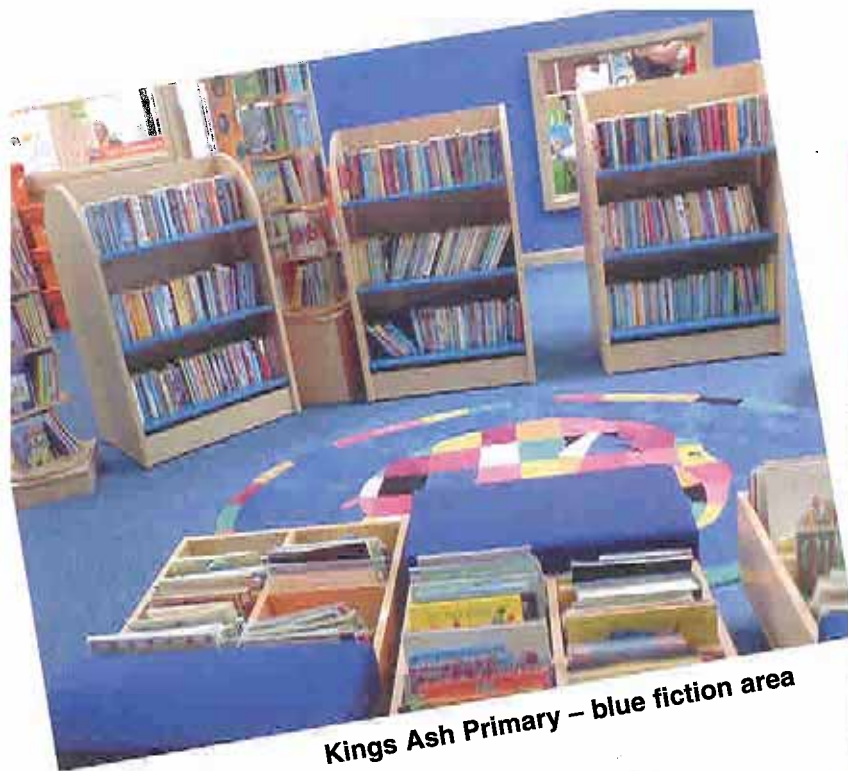
Kings Ash Primary – blue fiction area