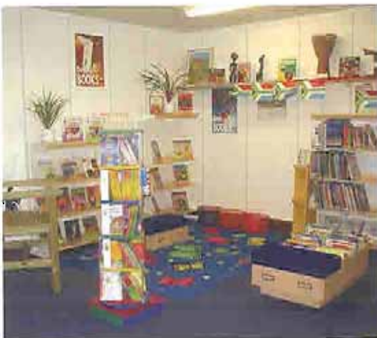
Clyst Heath Primary – reading corner and low base spinner