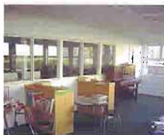
original library at Stoke Hill Infants