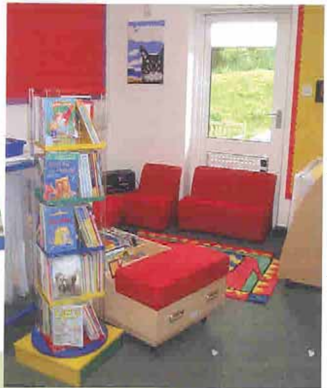
Thurlestone Primary – red fiction area